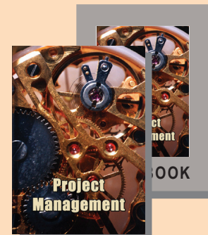
Project Management Paperback: 388 Pages, (Workbook also available)